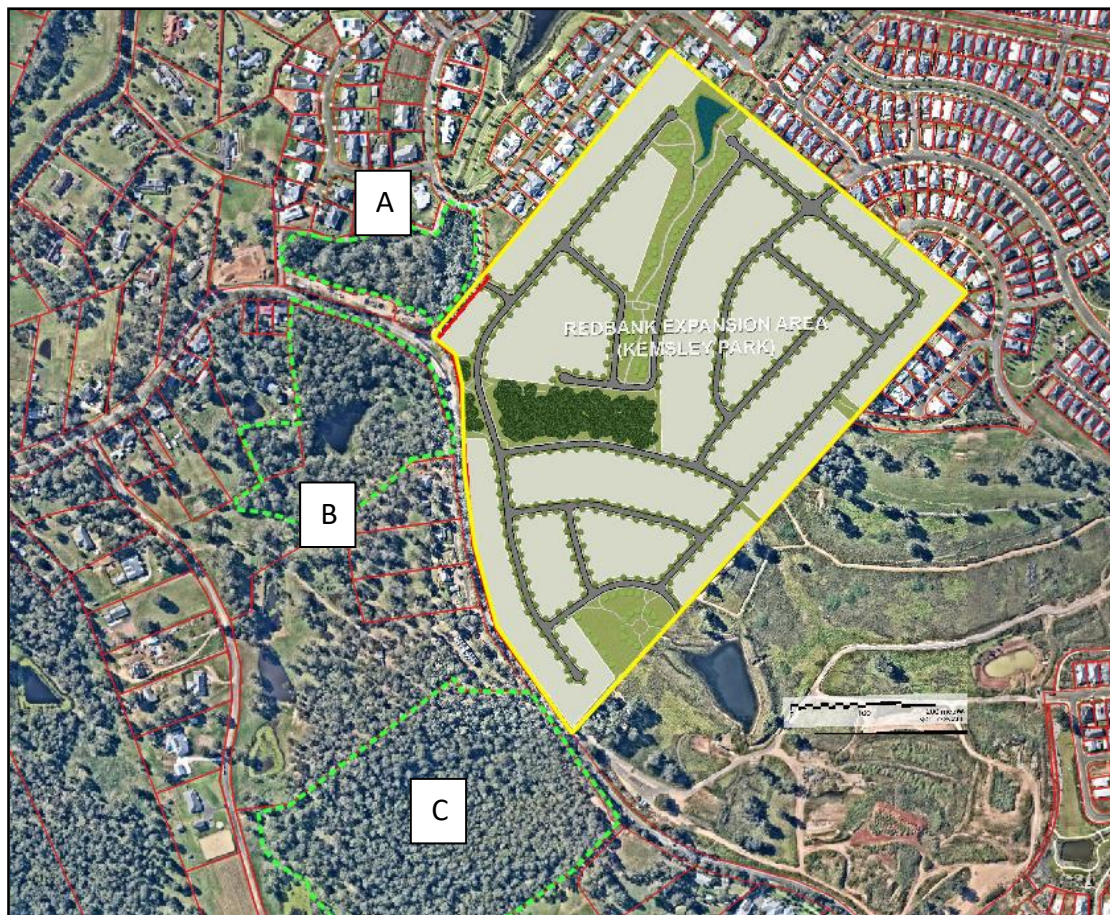
Figure 5: Vegetation study area - Image ex Nearmap

The vegetation was assessed for a distance of 140 metres from the proposed development site in each relevant direction.