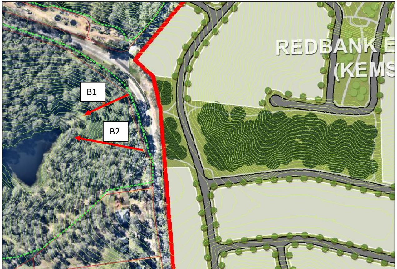
Figure 7; Slope/contour image

Transect B1 – Forest – Downslope > 10 to 15 degrees (assumed) (elevation 13.89 met / dist. 63.44 met = 12.35)