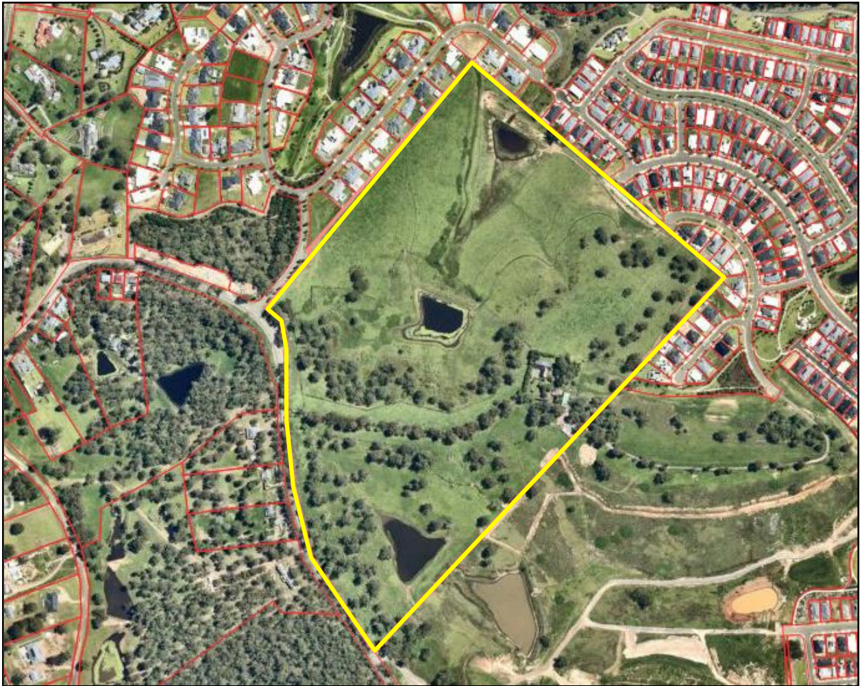
Figure 3; Aerial image of development site

At present the overall topography of the site would be best described as generally open grassland grazing paddocks with scattered shade trees on undulating terrain.