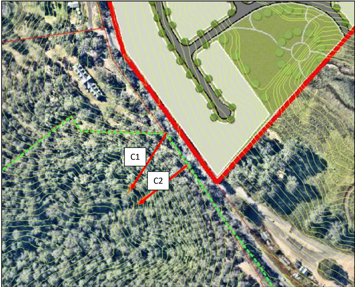
Figure 8; Slope/contour image

Transect C1 – Forest – Downslope > 10 to 15 degrees (assumed) (elevation 14.69 met / dist. 78.26 met = 10.63)