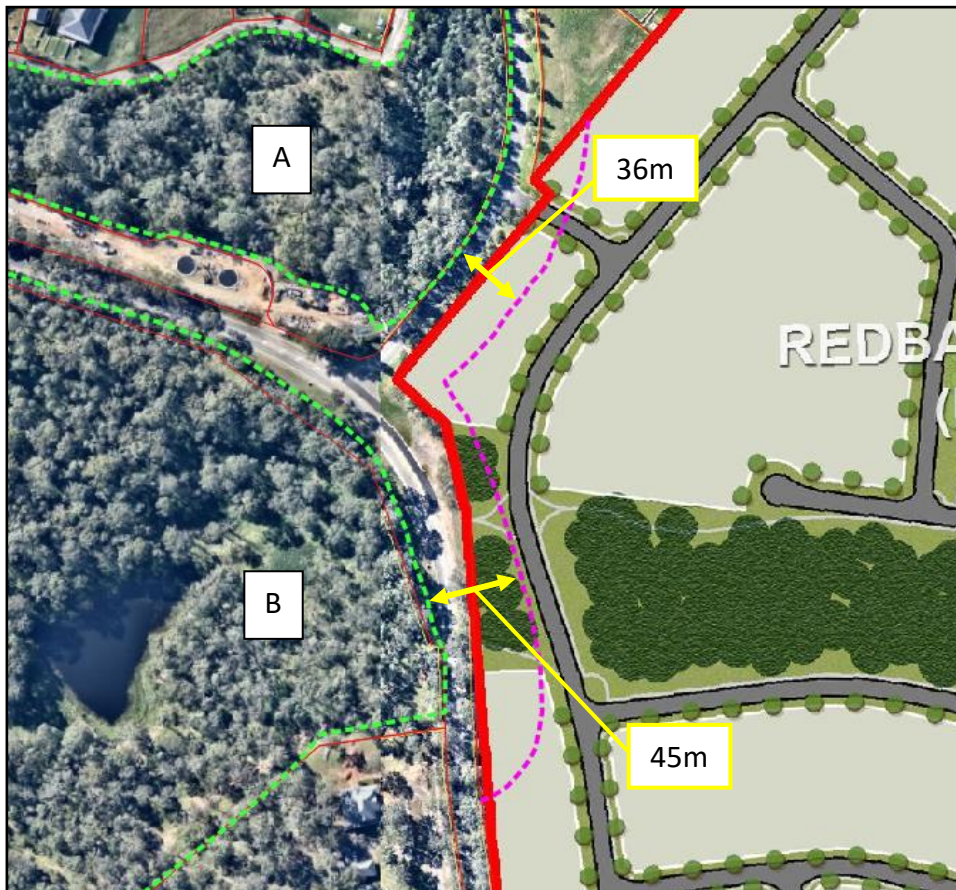
Figure 10; BAL 29 Threshold from the adjacent sections of vegetation - - - - -

The objective of Planning for Bush Fire Protection 2019 asset protection zones is to not have any potential building envelop exposed to greater than 29kW/m 2 of radiant heat and this can be easily achieved across the proposed subdivision as demonstrated within figures 9 and 10 below.