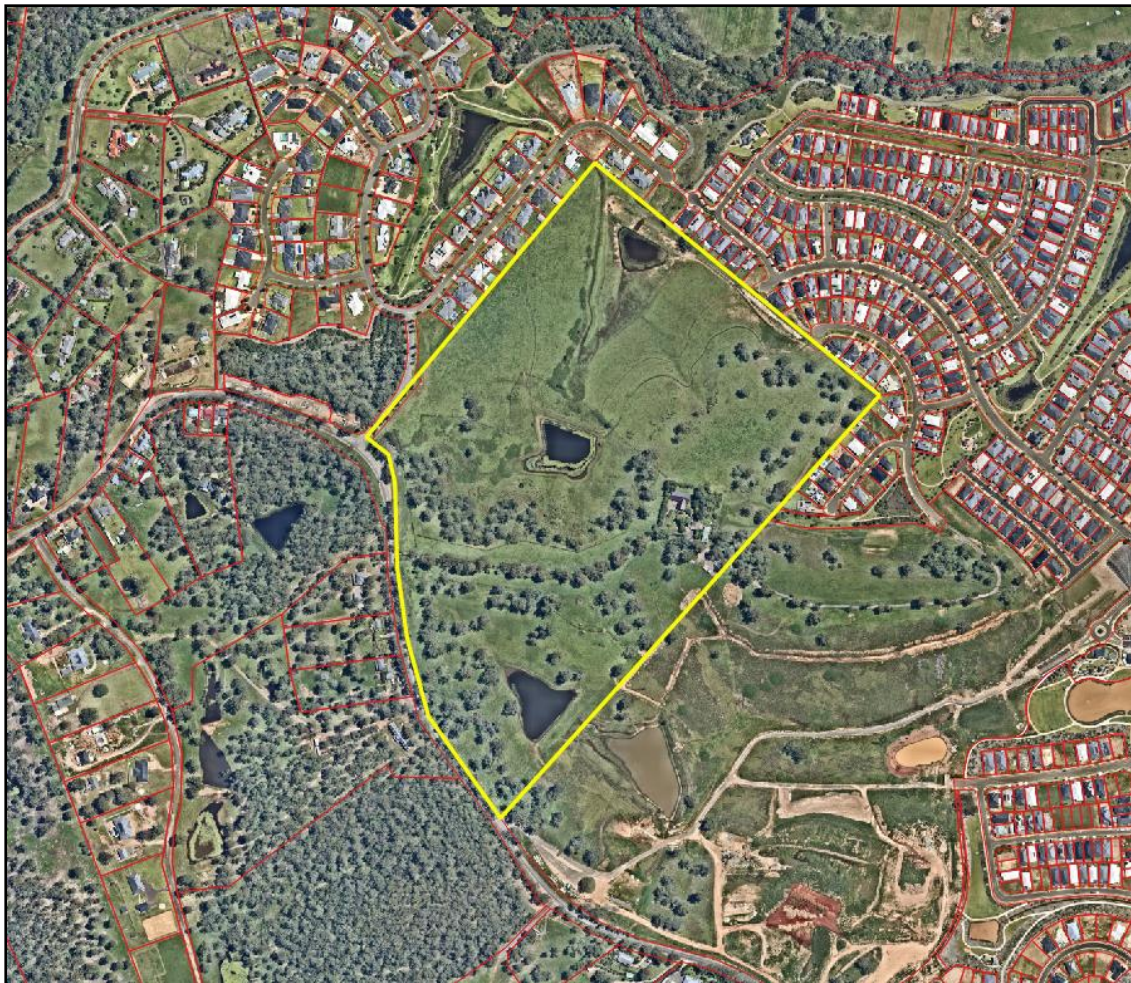
Figure 5; Adjoining lands to Rezoning Site

To the northwest of the rezoning site is the carriageway of Promontory Road and beyond this is the only other section of forest vegetation hazard identified as being effective on the development site. Further to the northwest adjacent to the rezoning site is existing residential development.