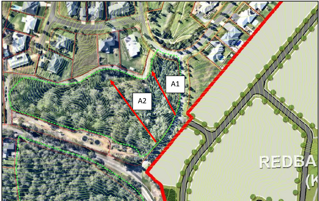
Figure 6; Slope/contour image ex Geoscience Australia

The effective slope of the land, out to a distance of 100 metres from the proposed scope of works (that is, the slope of the land most likely to influence bushfire behaviour for the purposes of calculating the Category of Bushfire Attack and Asset Protection Zones, has been assessed (using a clinometer) and digital desktop analysis.