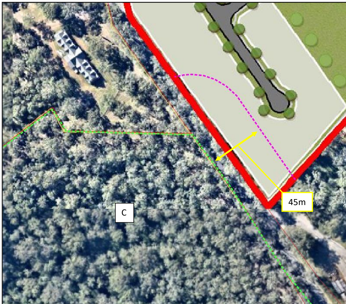
Figure 11; BAL 29 Threshold from the adjacent sections of vegetation - - - - -

BAL 29 separation distance of 45 metres can be provided from the Area C within a combination of the subject site as noted above and the carriageway of Grose Vale Road.