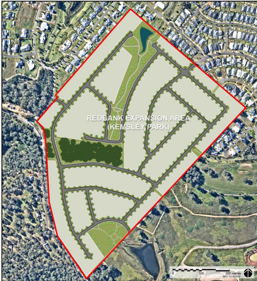
Figure 1; Extract of Concept Subdivision Development ex Orion

Ultimately the proponent is seeking to undertake a subdivision of the development site to provide for an estimated 300-350 residential parcels, construction of public roads together with open space areas and necessary infrastructure to support this development.